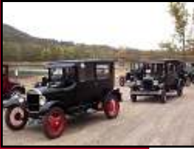
Enjoy pre-1950's Antique Cars At This Years 1st Annual Antique Car Show

If you would like to volunteer to help with this event please contact the DBI office at 439-6105