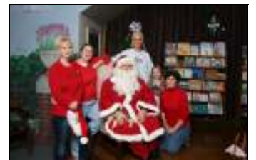
Santa takes time to pose with the gang from The Buzz while visiting Benton area children