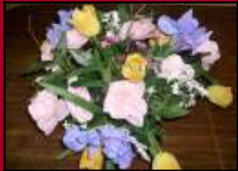
Spring Centerpiece Design for March 30th Make It Take It Class

Information or to register 439-6105 OR 439-9753